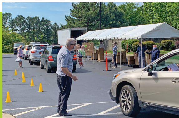
Frozen meals being picked up for delivery in the midst of COVID-19