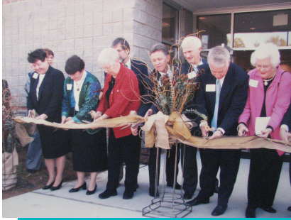
The 2004 opening and dedication of the Vernon Malone Center

In the fall of 2001, Meals on Wheels began the frozen meal program to better serve those who live in the outlying areas of the county where there are no pickup sites or volunteers available.