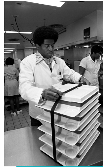
Meal preparation at Wake Memorial Hospital