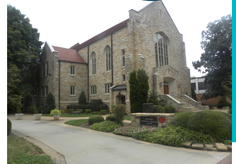
Hillyer Memorial Christian Church