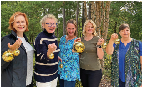
Members of the Golden Disco Committee hold up Golden Disco Balls while visiting the Umstead Hotel & Spa - the site of our Golden Disco celebration!

On February 12, 1974 MOW delivered the first meals to nine clients in Raleigh. Fast forward to 2024 and 11 million+ meals and 200,000+ clients later – it’s time to celebrate 50 years of serving our Wake County senior neighbors in need of meals and companionship!