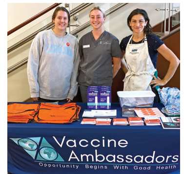
Volunteers from UNC Health, Vaccine Ambassadors, and Meals on Wheels of Wake County at the Five Points Friendship Cafe vaccine clinic."

With flu season fast approaching, we partnered with Diaper Train, Vaccine Ambassadors, and UNC Health to host free Flu Vaccine events at our Rosenwald, Five Points, and Capital Towers Friendship Cafe locations this fall. According to the CDC, "People 65 years and older are at higher risk of developing serious complications from flu, compared with young, healthy adults. This risk is due in part to changes in immune defenses with increasing age. While flu seasons vary in severity, during most seasons people 65 years and older bear the greatest burden of severe flu disease." Thanks to the help of our vaccine clinic partners, we can increase seniors' access to flu vaccines to bolster their immune health.