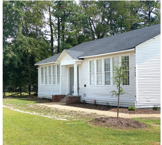
Exterior of the renovated Panther Branch Rosenwald School.

With your support, Meals on Wheels of Wake County hopes to extend our services at our Rosenwald site, and ultimately serve even more seniors who face food insecurity.